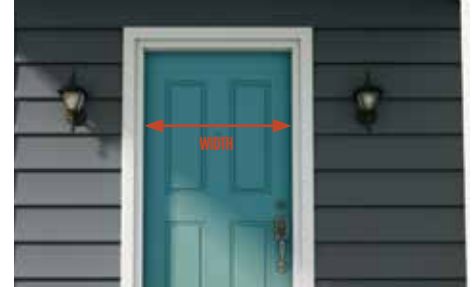
FRONT DOOR/DOOR JAMB